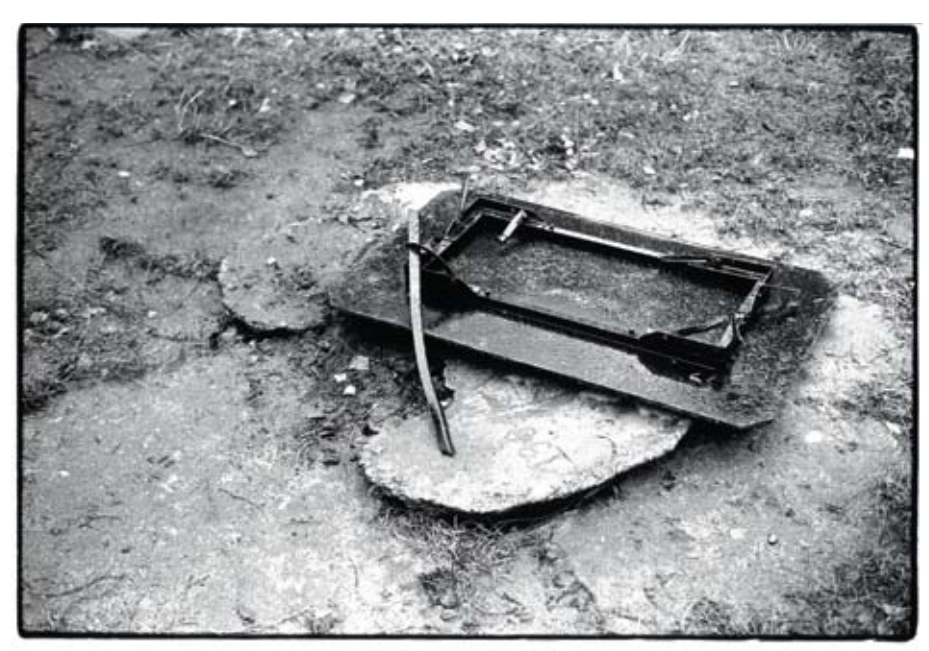
- как Фоина Георгионна поживает