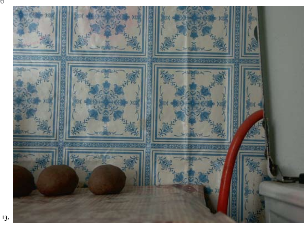
\label{lower_control_control_control} \textit{Joana Deltuvaite}. From the series \textit{Domestic Life} \ (2004). \ Colour print. \ Courtesy of the photographer.