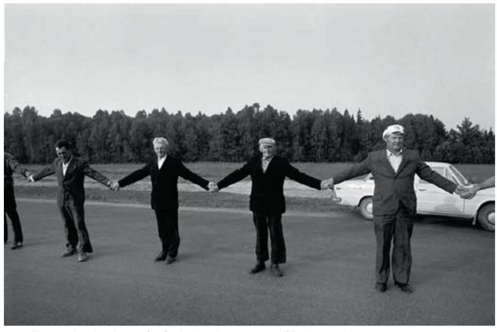
Romualdas Požerskis. The Baltic Way (1989). Silver-based print. Courtesy of the photographer.