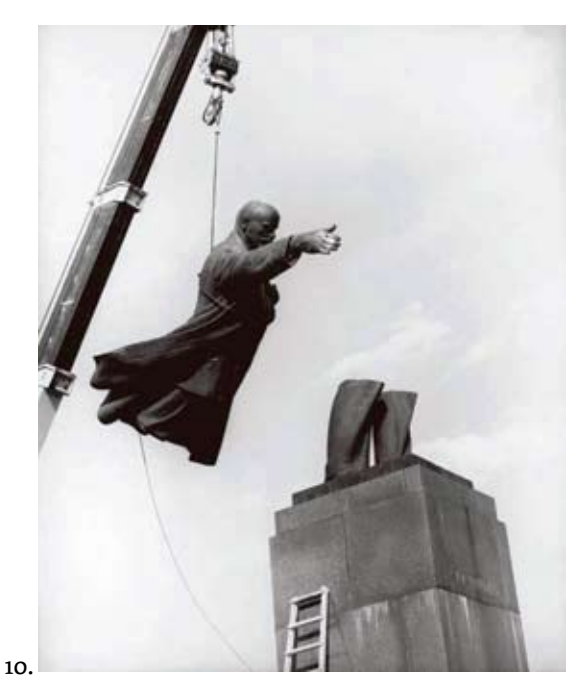
Antanas Sutkus. Goodbye, Party Comrades! (1991). Silver-based print. Courtesy of the photographer.