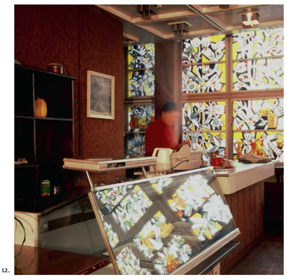
Arturas\ Valiauga.\ From\ the\ series\ About\ Pancakes\ and\ Borsht\ (2002).\ Colour\ print.\ Courtesy\ of\ the\ photographer.