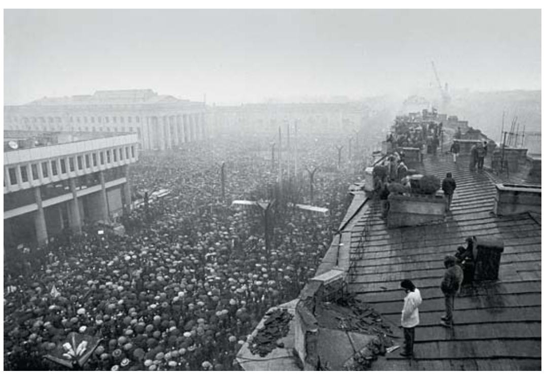
Romualdas Požerskis. At the Supreme Council of Lithuania (13 January, 1991). Silver-based print.