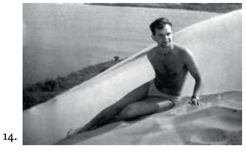
Deimantas Narkevičius. A still from the film Disappearance of a Tribe (2005).