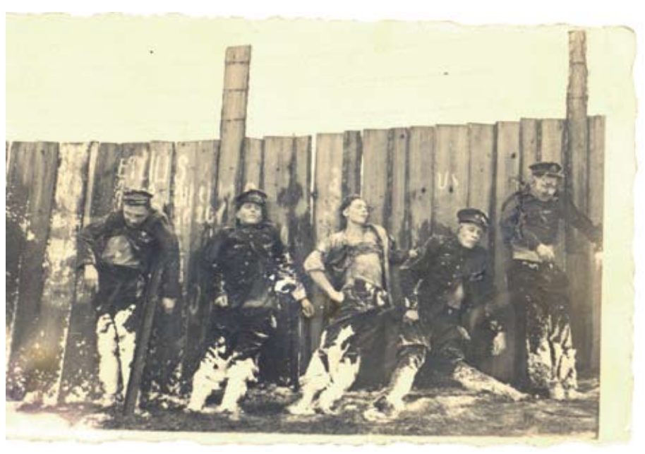
Unrecognised dead partisans from an unknown district (1940s). Silver-based print.