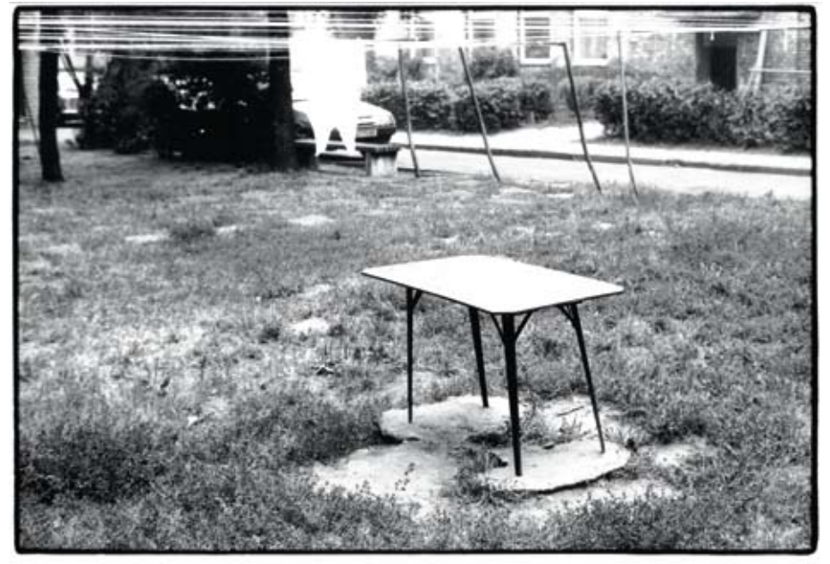
- Илья Иссифович, сыграем?