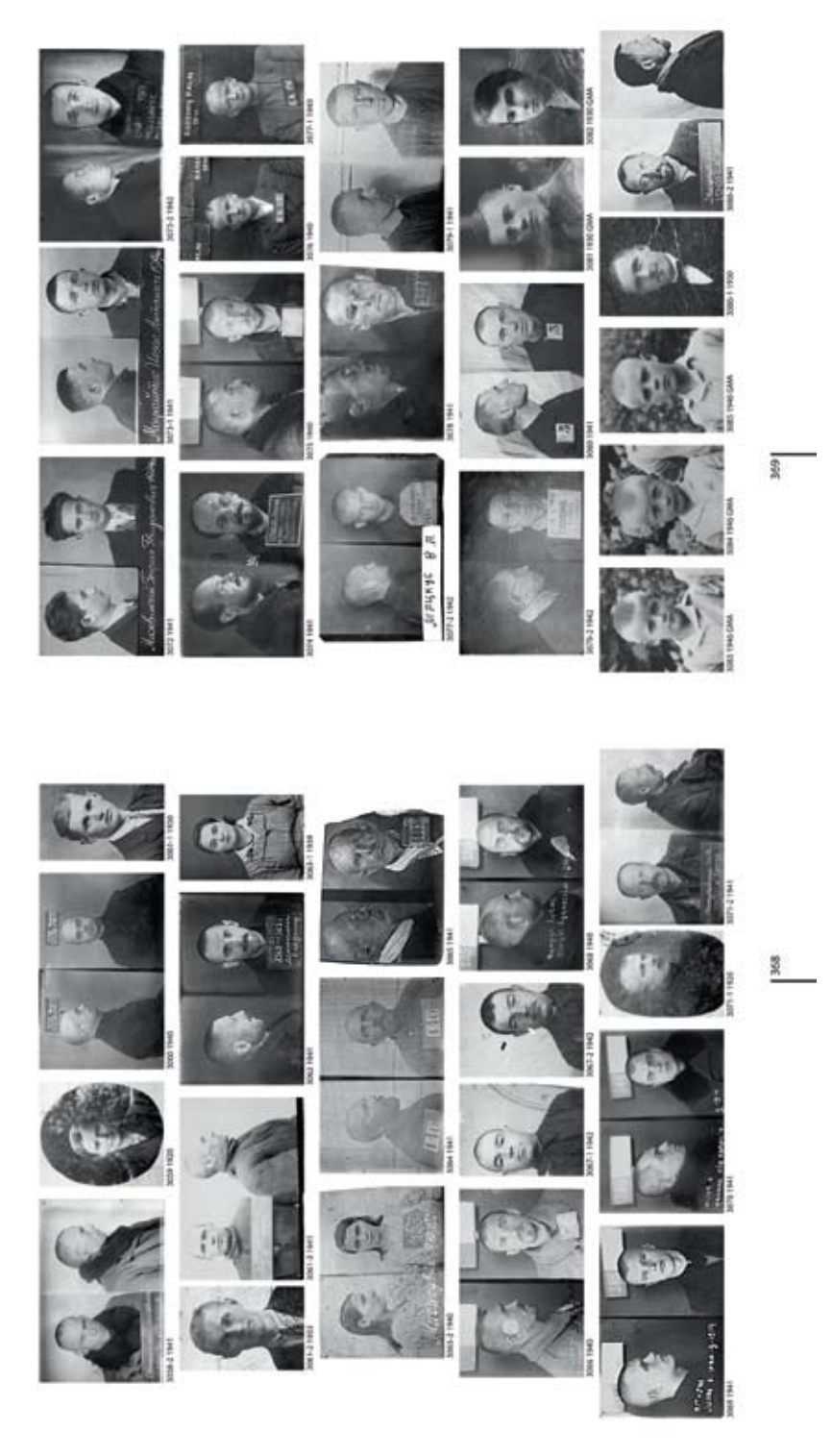
Kestutis\ Grigaliunas.\ From\ Diaries\ of\ Death\ (2012),\ Silver-based\ prints.\ Courtesy\ of\ the\ artist\ and\ The\ Museum\ of\ Genocide\ Victims.