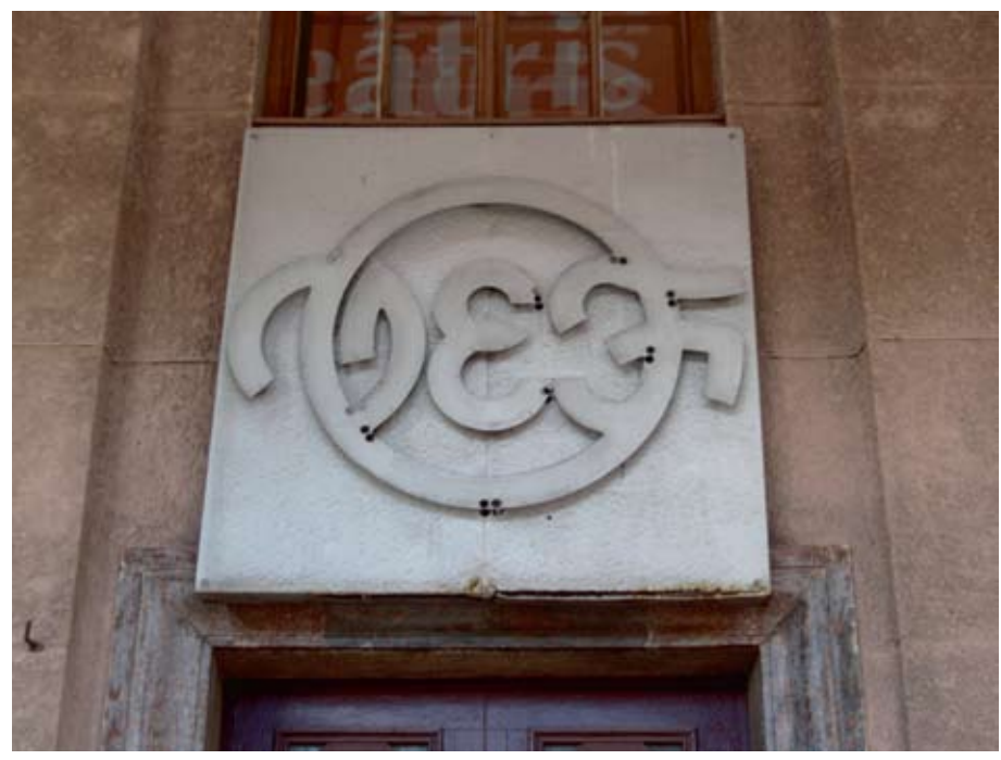
Logo of the VEF Palace of Culture. Photo by Aivars Holms, 2008. Monument Documentation Centre of the State Inspection for Heritage Protection, Republic of Latvia.