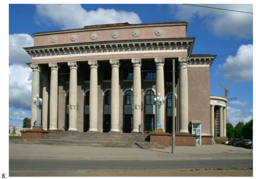
VEF Palace of Culture. Photo by Aivars Holms, 2008. Monument Documentation Centre of the State Inspection for Heritage Protection, Republic of Latvia.