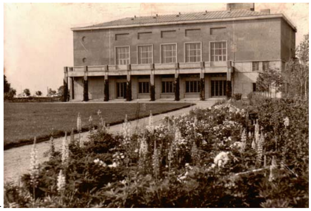
Zvejniekciems Palace of Culture.