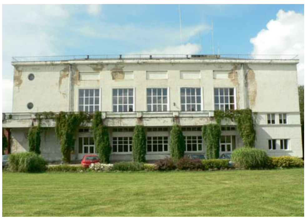
7. Zvejniekciems Palace of Culture. Photo by Maija Rudovska, 2010.