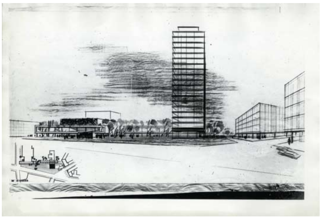
Marta Staṇa. Sketch of the Daile Theatre building and its surroundings. Latvian Museum of Architecture, no. S1149.