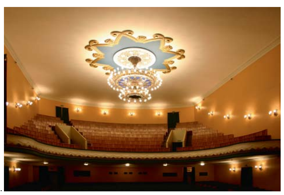
Interior of the VEF Palace of Culture. Photo by Aivars Holms, 2008. Monument Documentation Centre of the State Inspection for Heritage Protection, Republic of Latvia.