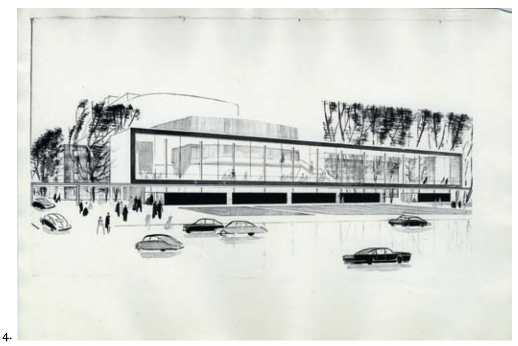
Marta Staṇa. Sketch of the façade of the Daile Theatre building (1961). Latvian Museum of Architecture, no. S1158-16.