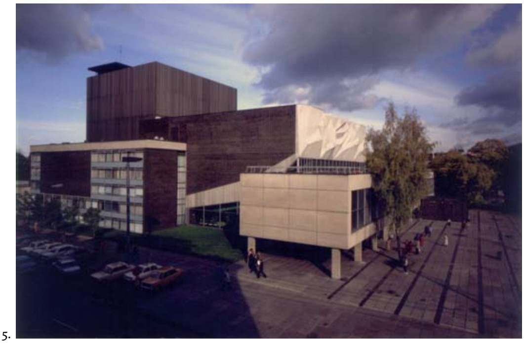
Daile Theatre building.