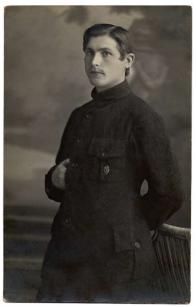
Gustavs Klucis, Photograph (c.1914–1915). Collection of the Latvian National Museum of Art (LNMA).