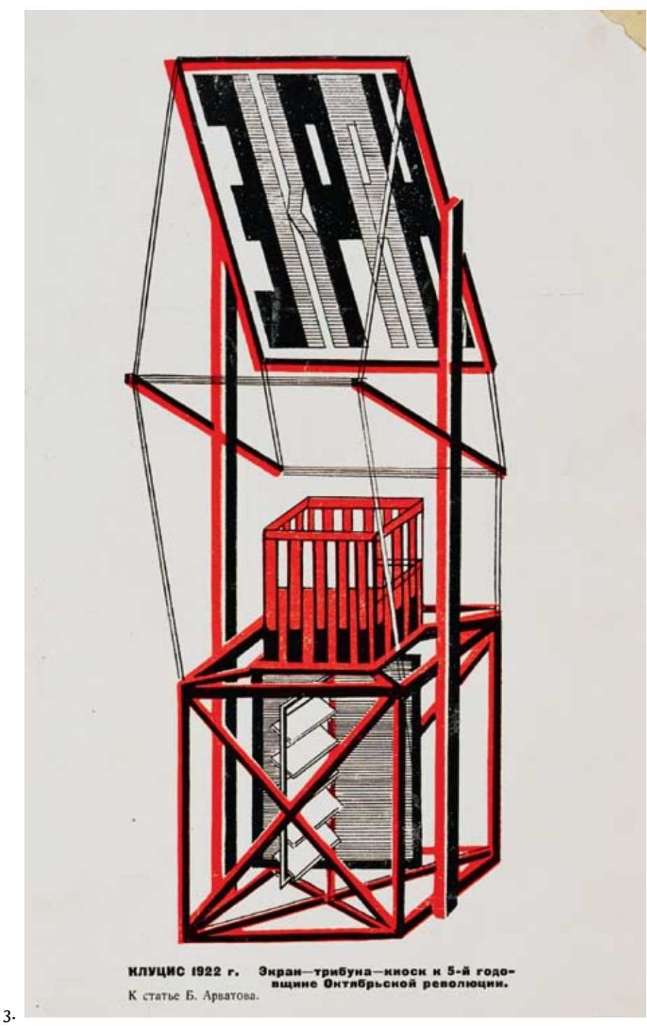
Gustavs Klucis. Screen–Tribune–Kiosk (1922) for the Fifth Anniversary of the October Revolution. Illustration for an article by Boris Arvatov in the magazine Пролетарское студенчество 1923, по. 2. Letterpress print on paper. 25.9 x 16.1 cm. LNMA inv. no. Z-8750/38.