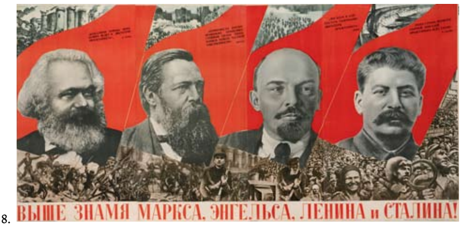
Gustavs Klucis. Poster Raise Higher the Flag of Marx, Engels, Lenin and Stalin! (1933). Lithograph on paper. 87 x 175 cm. LNMA inv. no. VMM Z-8769.