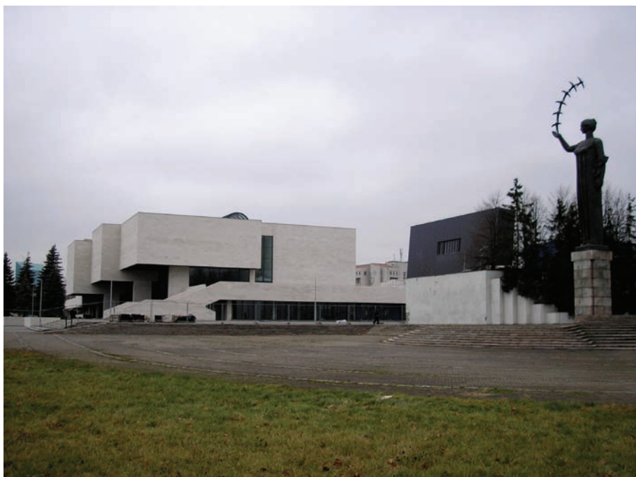
4. The National Gallery of Art, Vilnius (2009).