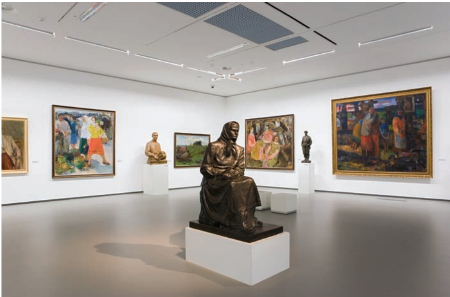
View from the section 'The Great Tradition', permanent exhibition of the National Gallery of Art, Vilnius (2009).