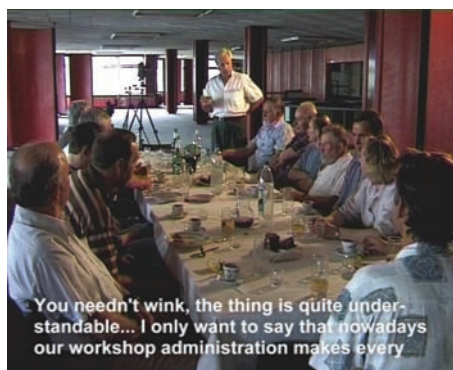
Works by Kazys Varnelis (USA) and Vladas Urbanavičius (Lithuania). View from the section 'Borders of Reality', permanent exhibition of the National Gallery of Art, Vilnius (2009).