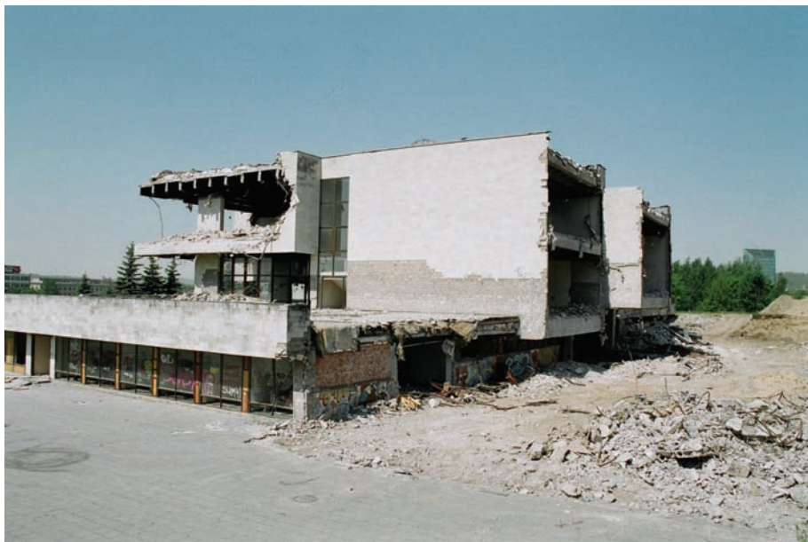
3. Reconstruction of the building of the National Gallery of Art (2005).